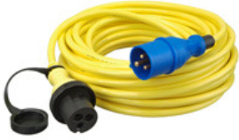
Shore Power Cable