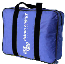
Shore Power Organiser Bag