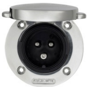
Shore Power Inlet stainless steel 3-pole